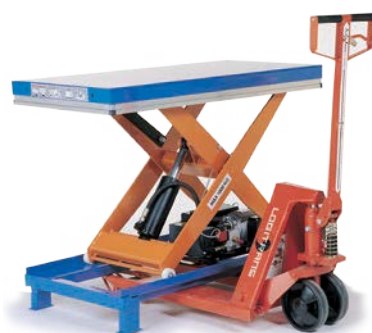
version with special base frame